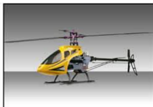
EK1H-E015 (碳纤维版 carbon edition) BELT-CP